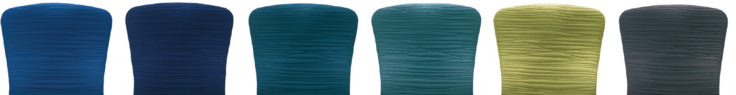
2SG07 Sapphire Spirit 2SG08 Cobalt Cheer 2SG09 Mediterranean Vim 2SG10 Teal Zeal 2SG11 Green Apple Zing 2SG12 Pewter Joy