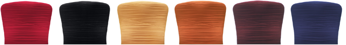
2SG01 Ruby Fervor 2SG02 Black Verve 2SG03 Amber Delight 2SG04 Ginger Zest 2SG05 Mulberry Elan 2SG06 Orchid Vigor