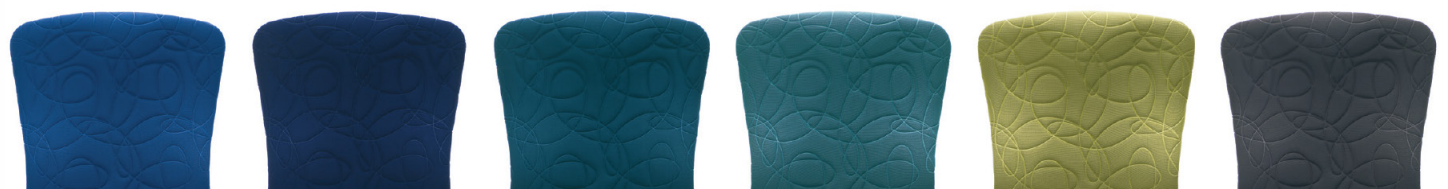
2SG07 Sapphire Spirit 2SG08 Cobalt Cheer 2SG09 Mediterranean Vim 2SG10 Teal Zeal 2SG11 Green Apple Zing 2SG12 Pewter Joy