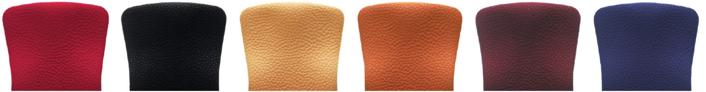
2SG01 Ruby Fervor 2SG02 Black Verve 2SG03 Amber Delight 2SG04 Ginger Zest 2SG05 Mulberry Elan 2SG06 Orchid Vigor