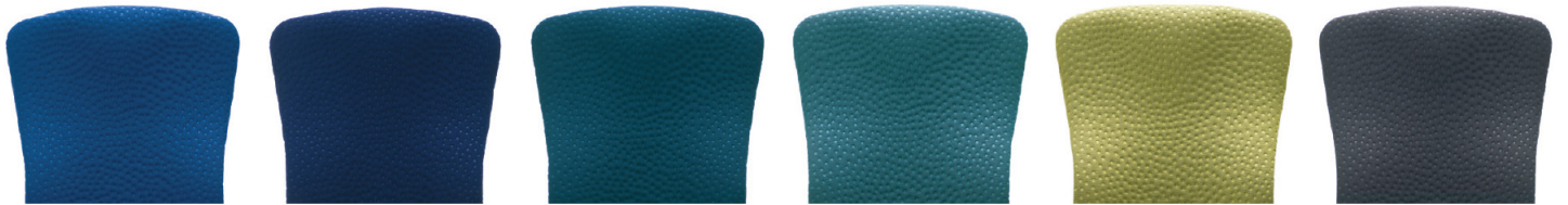
2SG07 Sapphire Spirit 2SG08 Cobalt Cheer 2SG09 Mediterranean Vim 2SG10 Teal Zeal 2SG11 Green Apple Zing 2SG12 Pewter Joy