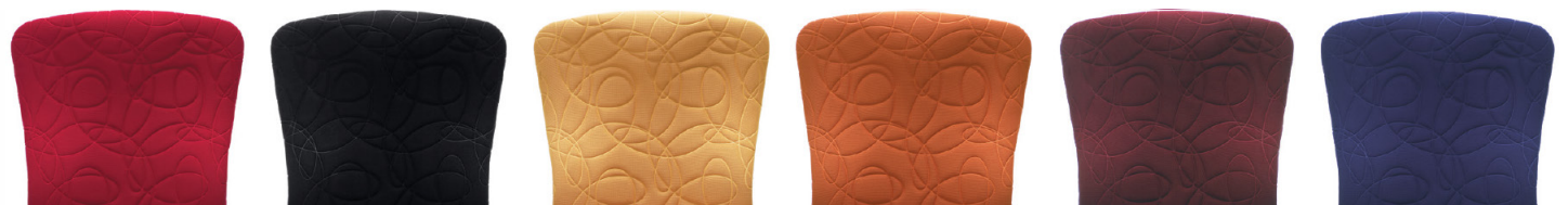
2SG01 Ruby Fervor 2SG02 Black Verve 2SG03 Amber Delight 2SG04 Ginger Zest 2SG05 Mulberry Elan 2SG06 Orchid Vigor