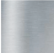
PA00 - Polished Aluminum